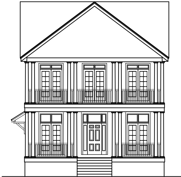
Front Elevation N.T.S