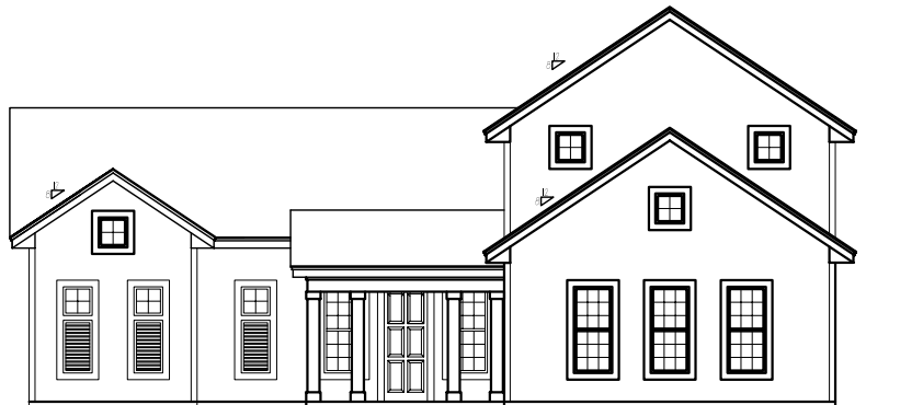
Front Elevation N.T.S