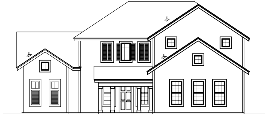
Front Elevation N.T.S