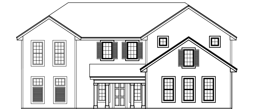
Front Elevation N.T.S

AREA 4 Bedrooms + Study, 3.5 Bath 1734 sqft First Floor Cond. 1771 sqft Second Floor Cond. 3505 sqft Total Cond. 96 sqft Front Porch 132 sqft Rear Porch 525 sqft Garage 4258 sqft Total Gross