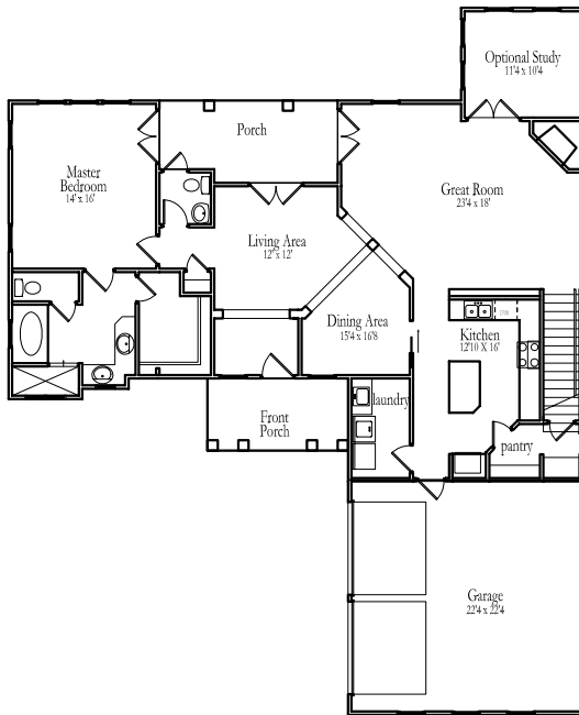
Floor Plan N.T.S