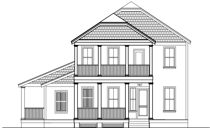
Front Elevation N.T.S