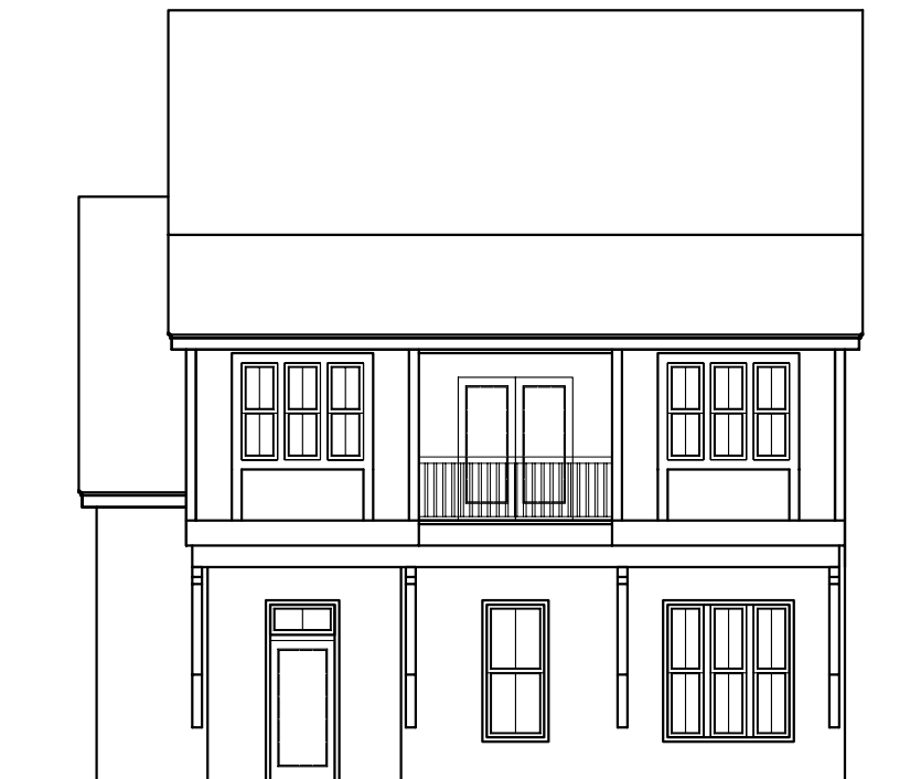
Front Elevation N.T.S

Advanced Building Concepts bob@advancedbuildingconceptsinc.com 352-379-0898 CGC 1511811