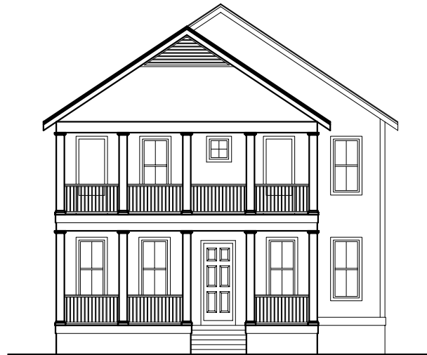
Front Elevation N.T.S