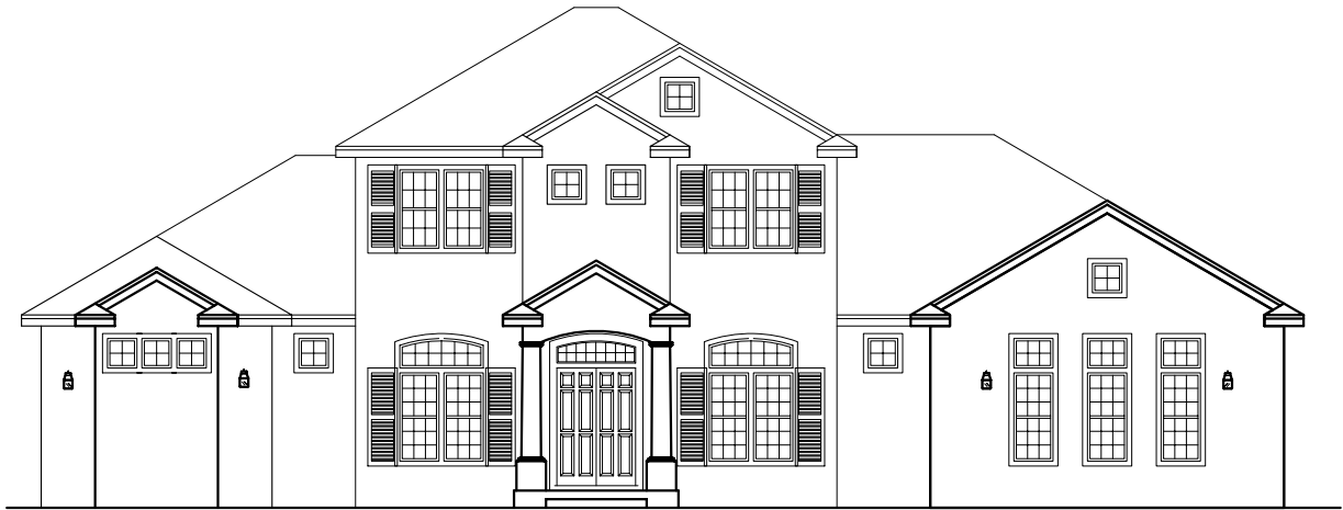
Front Elevation N.T.S.