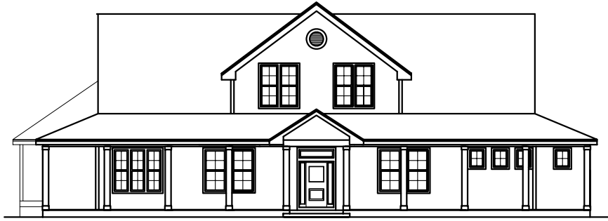
Front Elevation N.T.S