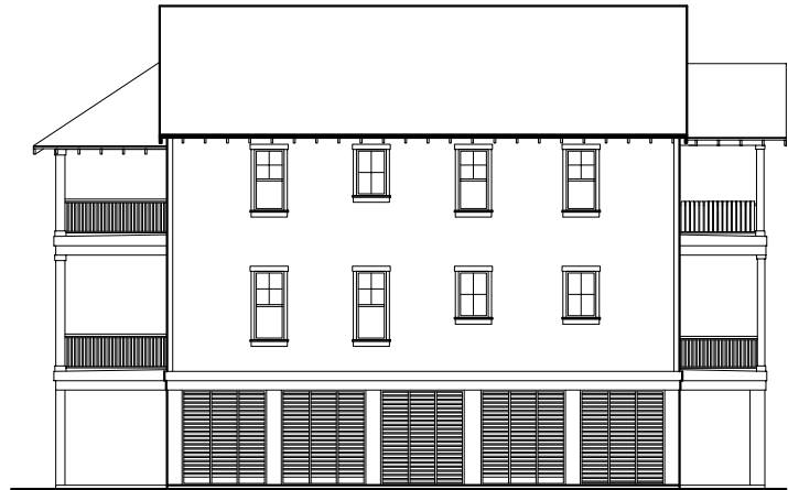
Left Elevation N.T.S

AREA 4 Bedrooms, 4.5 Baths 1411 sqft First Floor Cond. 1411 sqft Second Floor Cond. 2822 sqft Total Cond. 694 sqft Porches 3516 sqft Total Gross (Not Including 1st Floor)