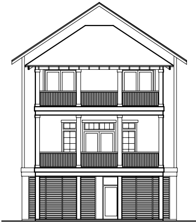
Front Elevation N.T.S