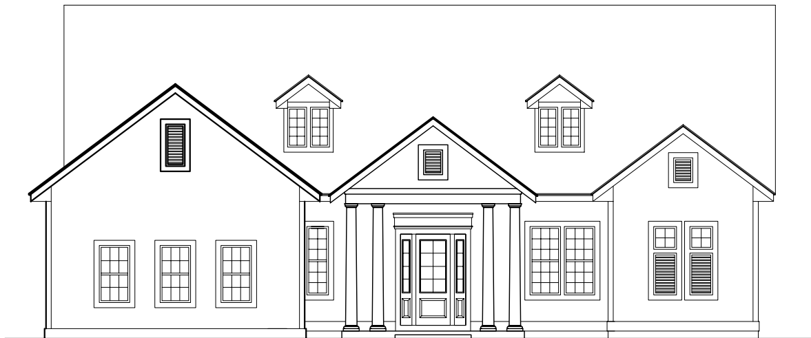
Front Elevation N.T.S