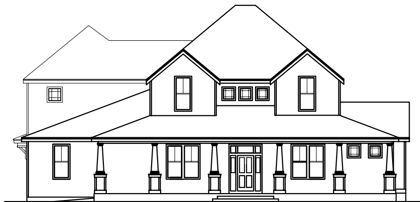
Front Elevation N.T.S