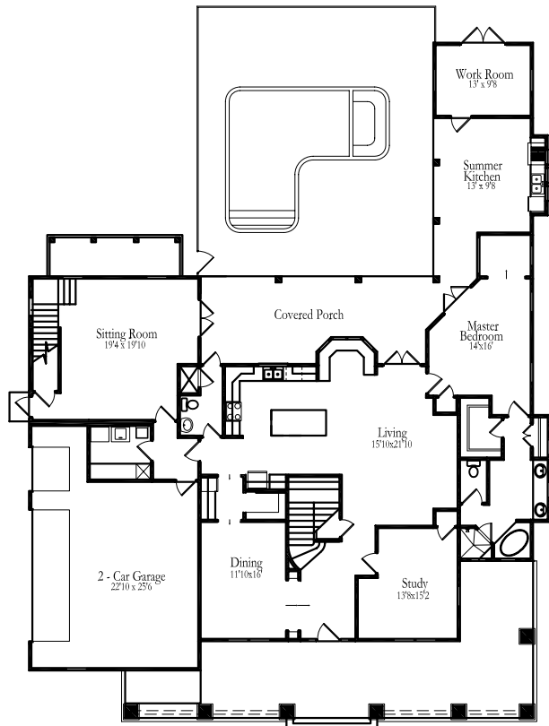
Floor Plan N.T.S